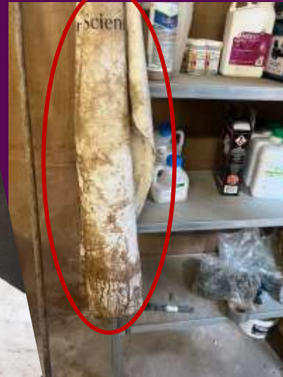
Apron in chemistry room