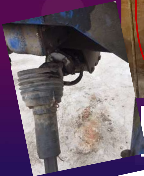
Defective PTO shaft