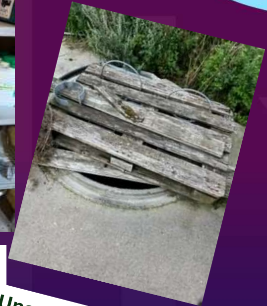
Unsafe cover of well