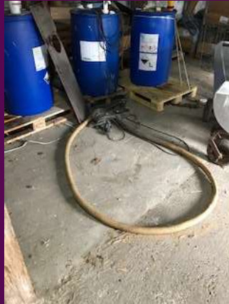
Loose hose on the floor