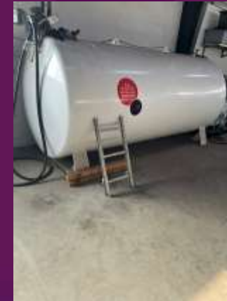
Defective ladder at diesel tank