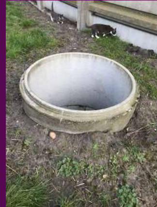
Open well at slurry tank