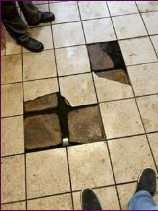
Missing tiles in the milking room