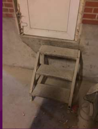
Stairs from the feed barn